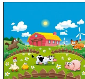
Farm image

We are still looking for volunteers for set up on the Thursday/Friday, bar shifts & litter picking over the weekend, BBQ help & cleaning up afterwards on the Sunday... there are many jobs to be done! The rota has been sent out via email so PLEASE SIGN UP... your